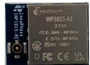
U.FL Antenna (17.0 x 12.8 x 2.5mm)

Contact InnoPhase at sales@innophaseiot.com for a demonstration and access to the Smart Video ADK